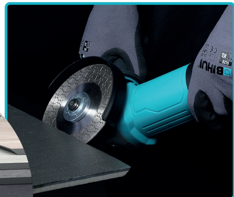
BU-DPE125 Hot Pressed Grinding Diamond Blade